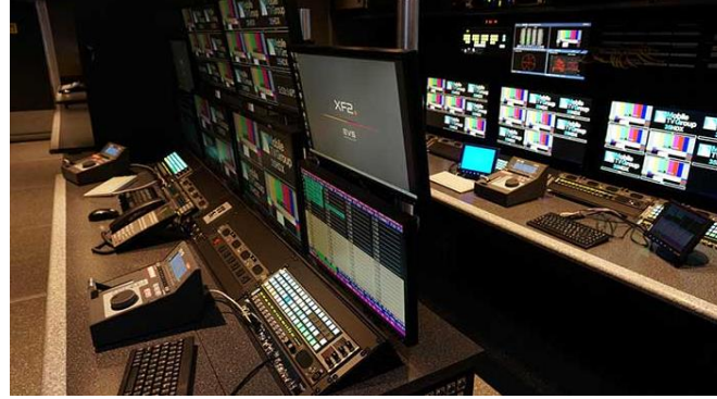
Replay- 35 HDX