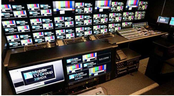
Production- 35 HDX