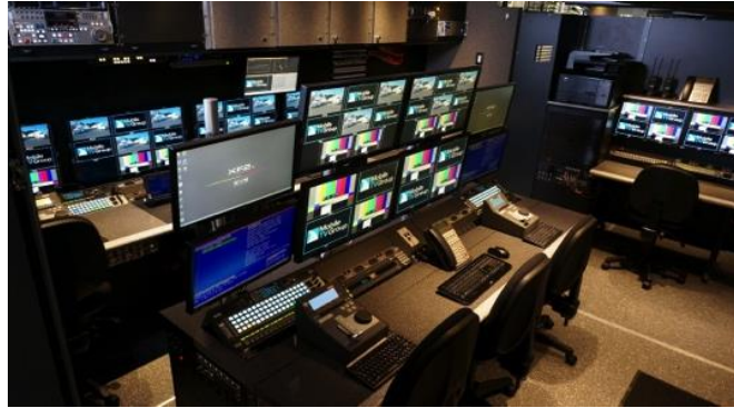
Replay- 36 HDX