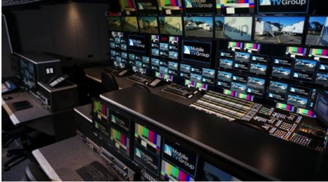
Production- 36 HDX