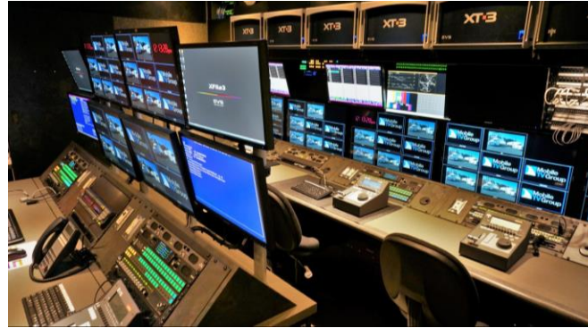
Replay- 38 FLEX