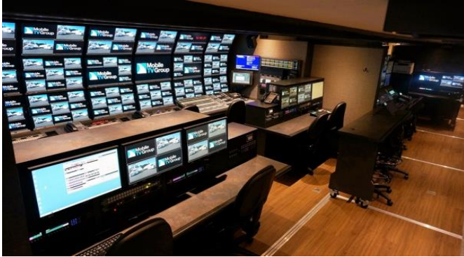
Replay- 40 HDX