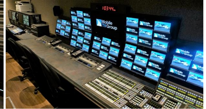
Production- 40 HDX